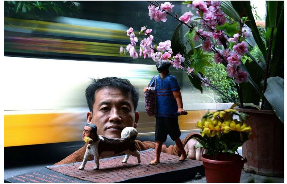
His sculpture originated from his beloved pet Pepe.

He would stay at home reading books or writing his autobiography when he accumulated a few money. He would get up at 7 o'clock, light up a cigarette while recalling his experience. When it comes to how to make inventions specifically, he would slur his speech and talk his dreams repeatedly full of confidence. He is pretty sure that he had created a "theorem" which is "no one else's, before or since", to depict the past, the present and the future. The inspiration of his