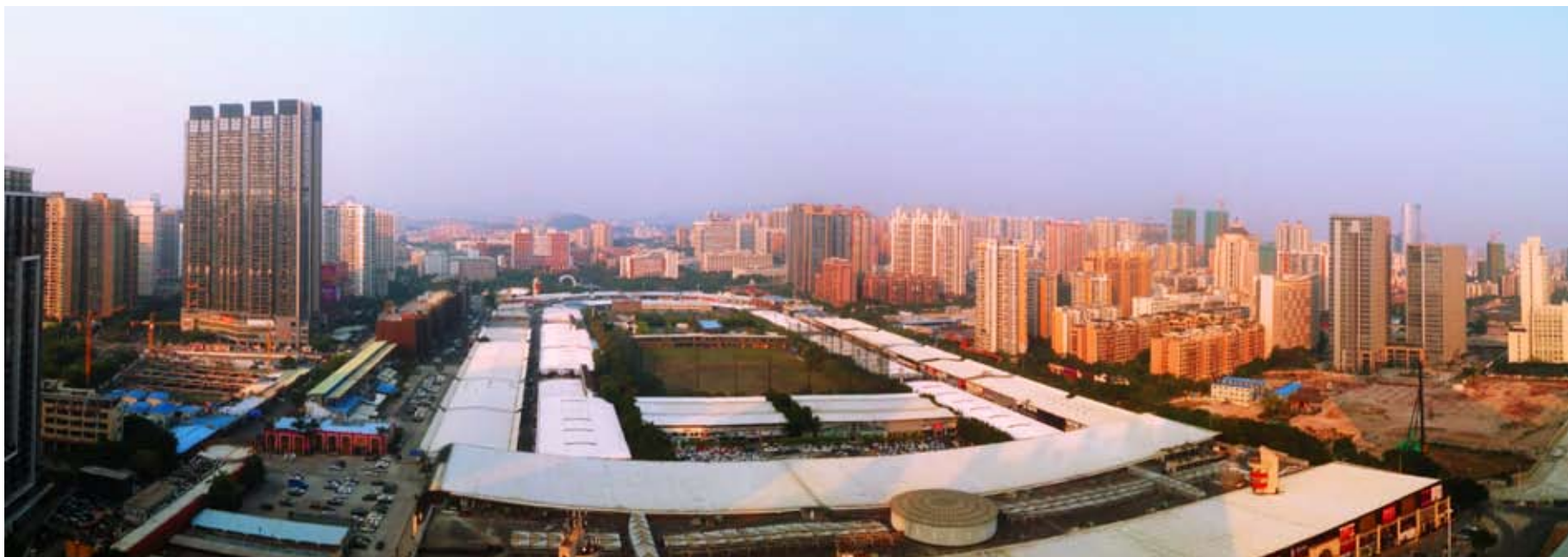
Full view of Guangzhou Racecourse.