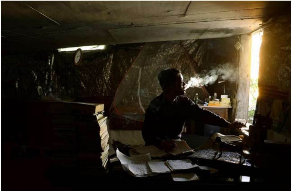
He likes smoking while recalling his experience.