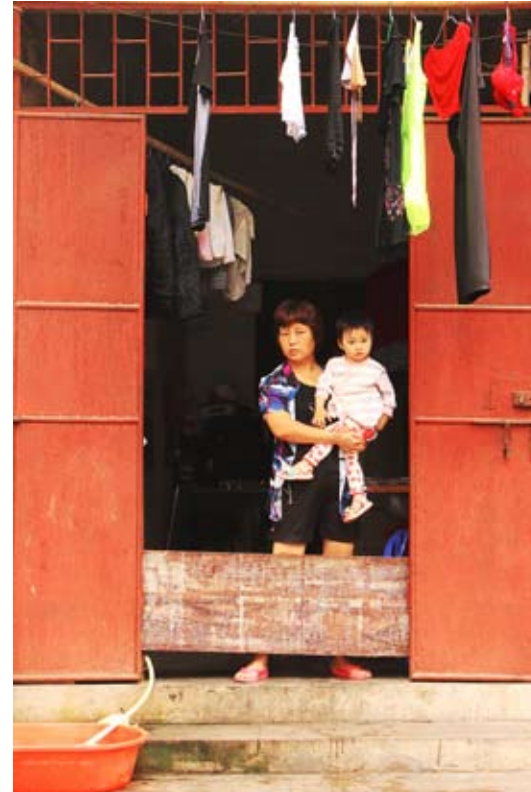
A Normal Day

It was a weekday, the landlady was bored to death, whose business was not thriving. Her stall mainly sells dry foods.