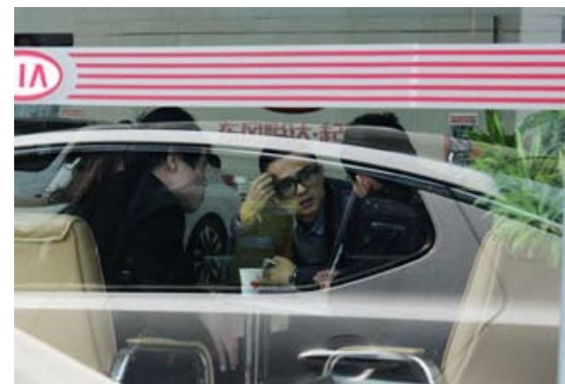
Customers were asking specific questions about the car he wanted to buy.