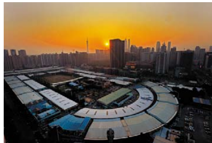
Guangzhou Racecourse Motor City in the last sunset of 2013.

Whereas, no matter how reluctant to accept the reality, the development of modern city will run over whatever in its way. Nevertheless,the history here would never fade away. We could cherish our memories, and witness the cities' development.