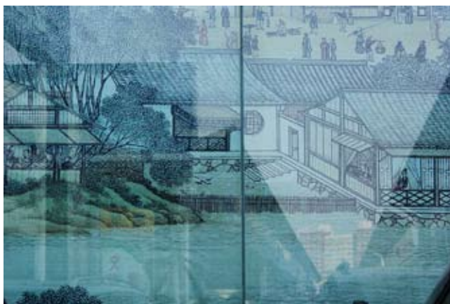
Racecourse reflected on the window of a mall. It looks like the old time was having a conversation with the modern time.