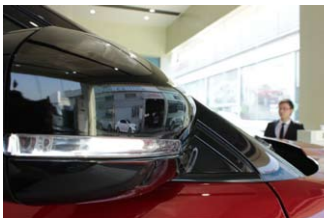
It was on the morning when business was rare. The seller was waiting for customers.