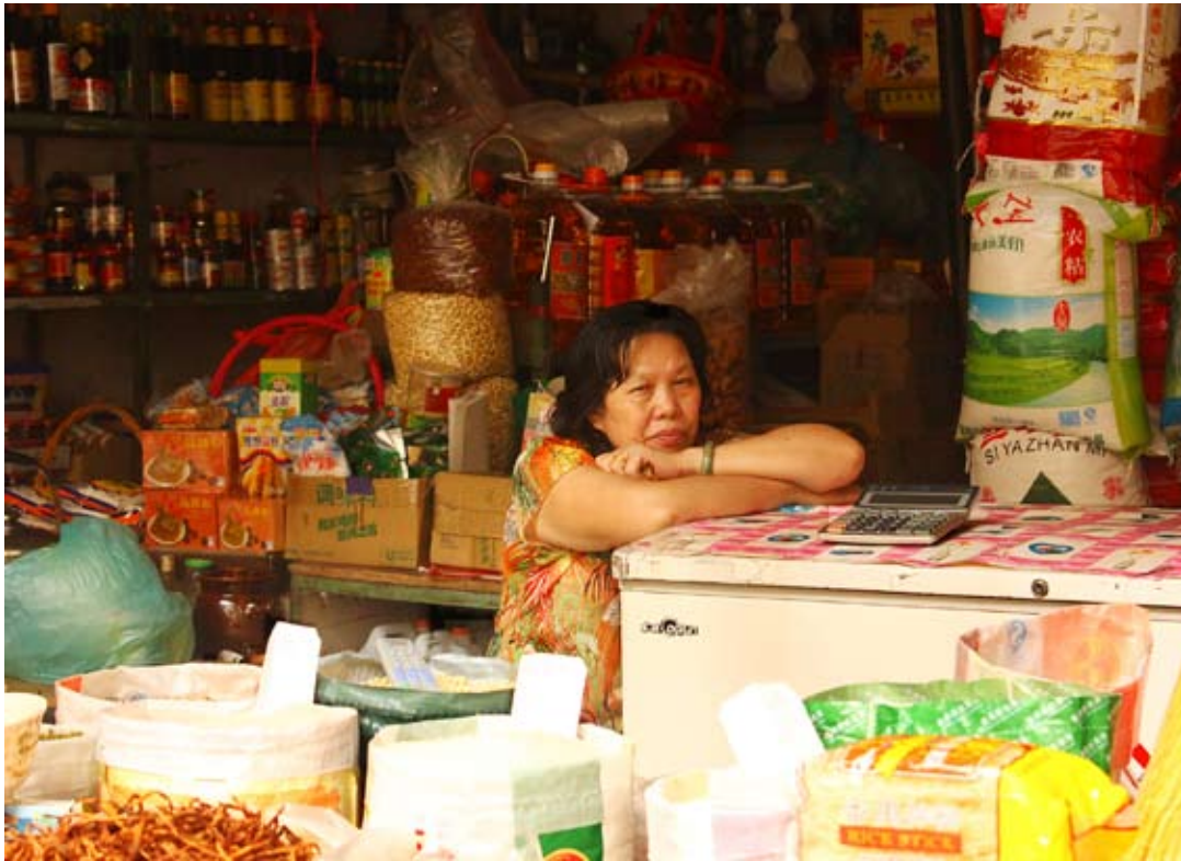
A Grocery Store

It was a weekday, the landlady was bored to death, whose business was not thriving. Her stall mainly sells dry foods.