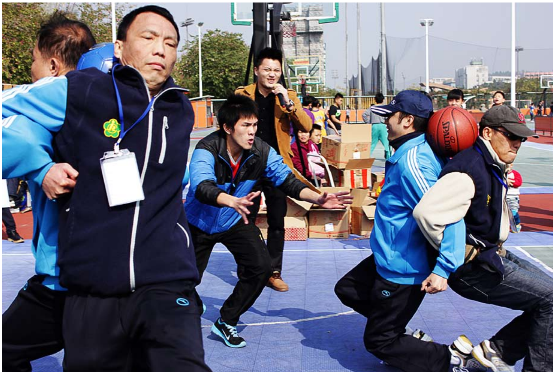
In the competition of Two People Carrying One Basketball Final, these adults with mental disabilities spared no effort to win the first prize.