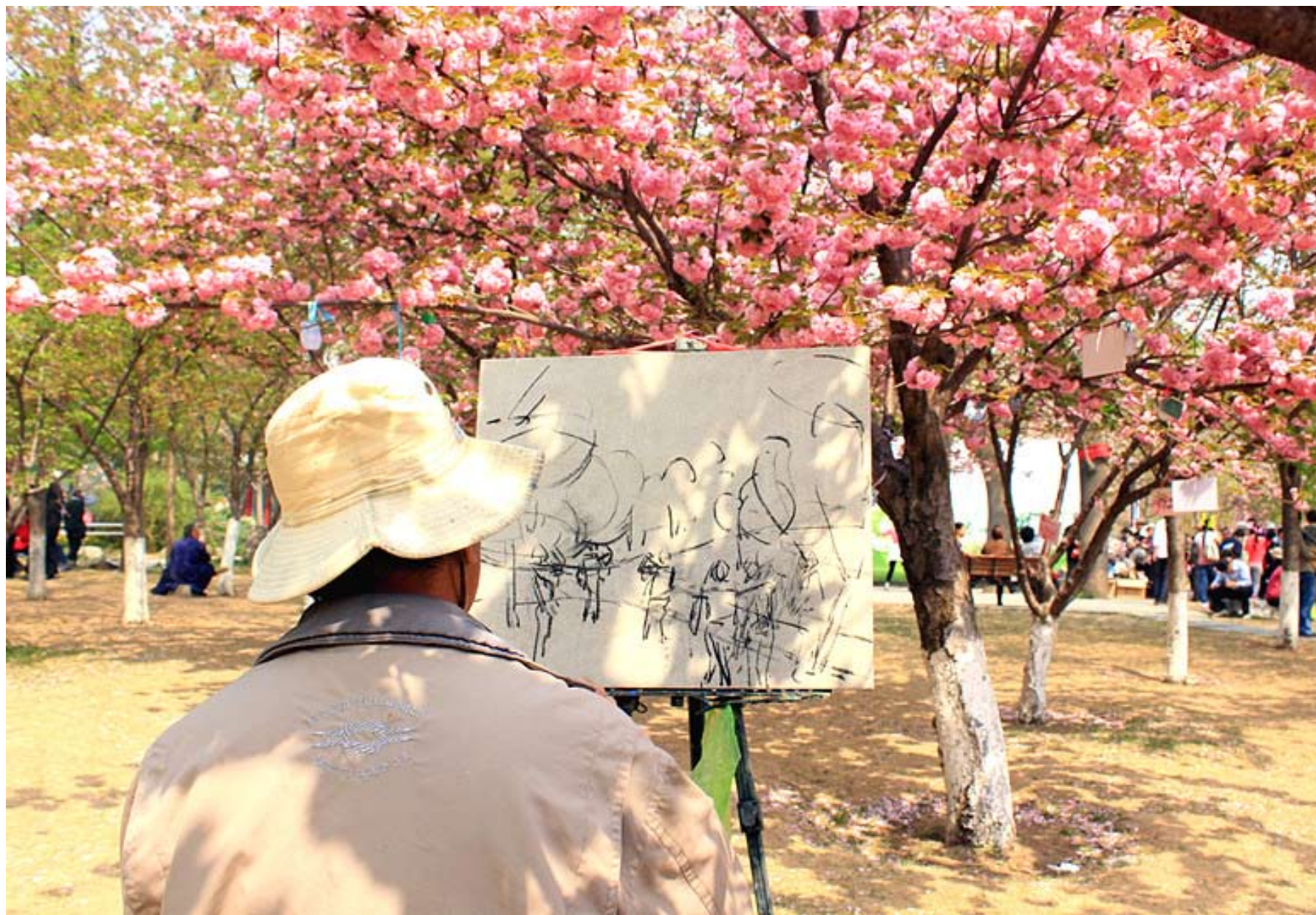
A Painter·Beijing YuYuantan Park

A man was drawing a picture for cherry blossoms to record the beauty of spring.