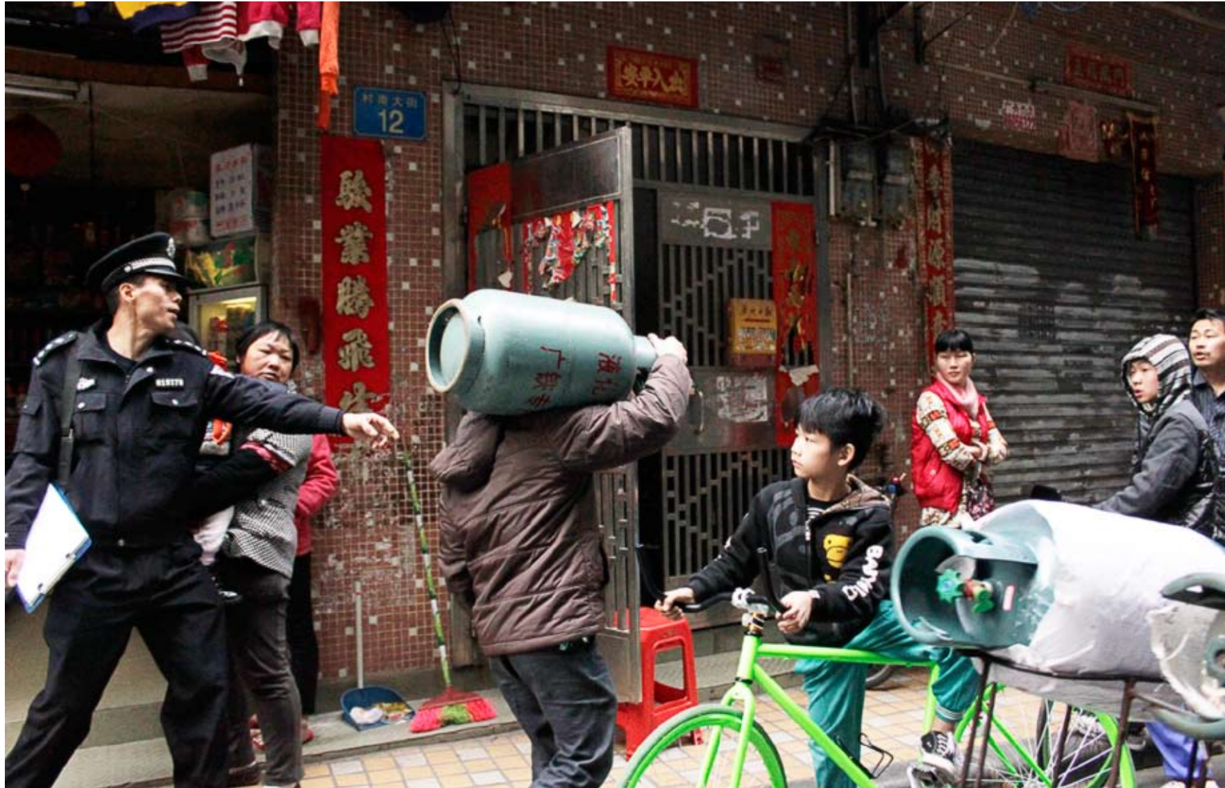
The policeman of Public Security Bureau of Fire Protection forbade the resident to put the explosive gas tank to the house nearby.