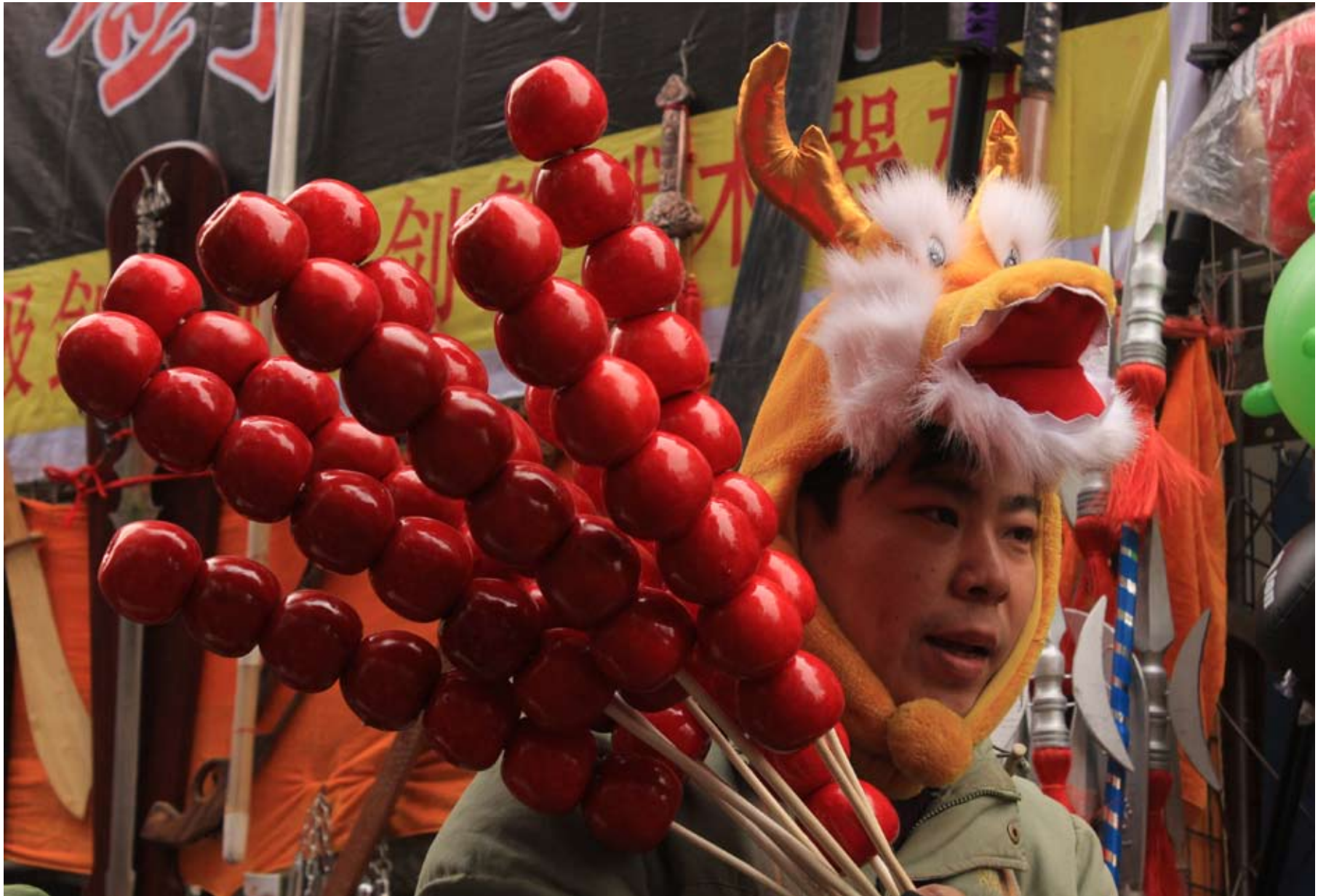
A Vendor-Beijing DiTan Temple Fair

The vendor was selling plastic sugar-coated berry, which showed hope for the new year.